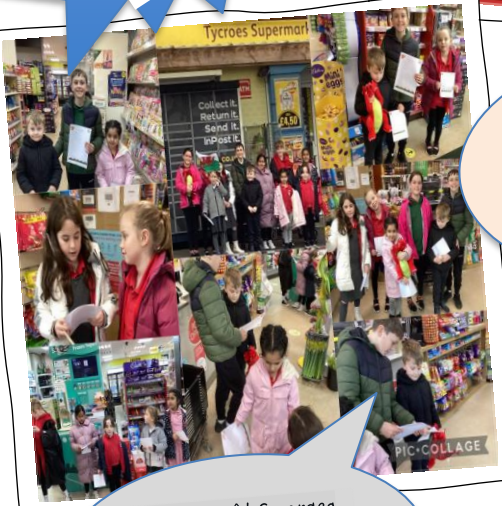
The Criw Cŵl Cymraeg enjoyed promoting the Welsh language in Tycroes supermarket