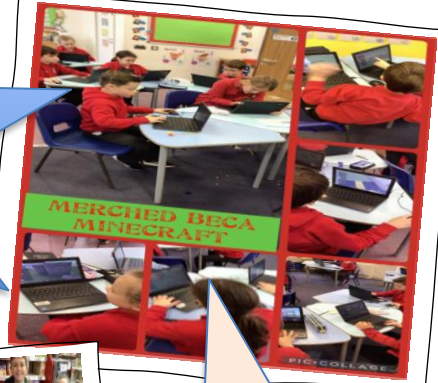
Dosbarth Fferws using Minecraft to build tollgates and tollhouses based on the Rebecca Riots.