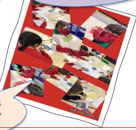
Dosbarth Cennen looked at 'Diwydiant' for Welsh Week.