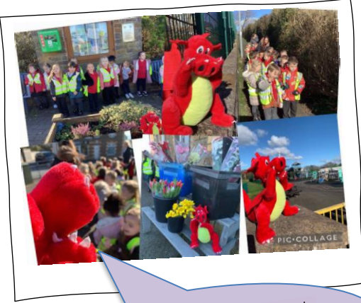
Dosbarth Aman Derbyn showed Fflam y ddraig around Tycroes and shared some local history!