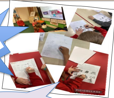
Safer Internet Day activities in Dosbarth Cennen!

Weekly round up! What have we been doing?