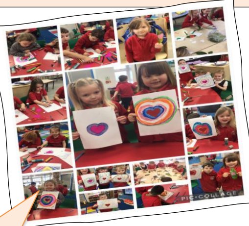
Valentines activities in Dosbarth Tywi!