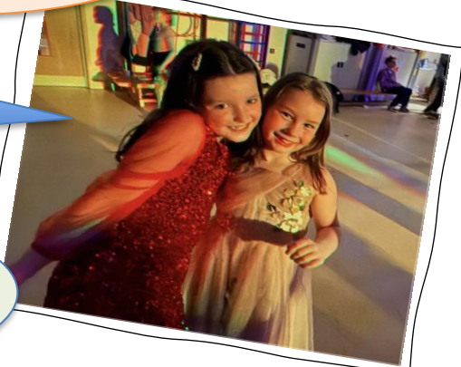
Dosbarth Gwili and Dosbarth Dulais visited the community gym!