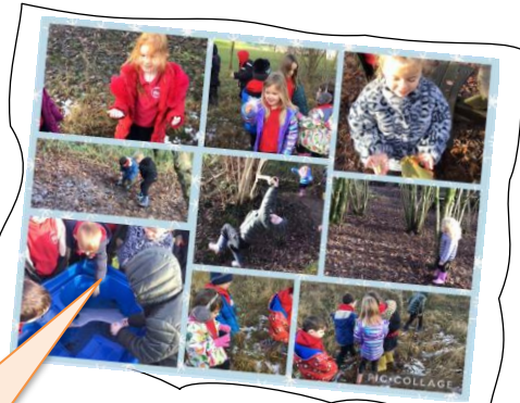
A Winter Walk in Dosbarth Tywi!