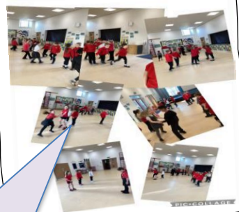
Dawnsio Gwerin in Dosbarth Cennen!

Weekly round up! What have we been doing? @YsgolTycroes