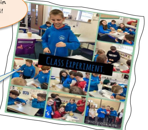
Insulation experiment in Dosbarth Gwili!