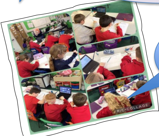
Dosbarth Dulais exploring world and local mountain regions!