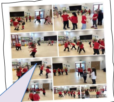
Dawnsio Gwerin in Dosbarth Cennen!

Weekly round up! What have we been doing? @YsgolTycroes