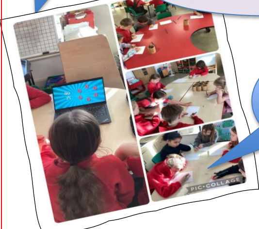
Dosbarth Cennen have been completing maths challenges.