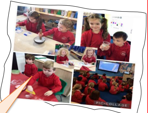
Exploring ice in Dosbarth Tywi!